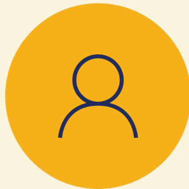
Profiles of inspiring Order of Australia recipients