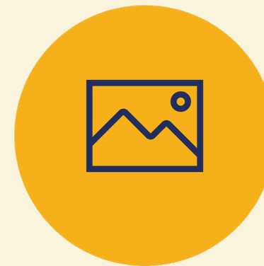
Editorial and images for e-newsletters and websites