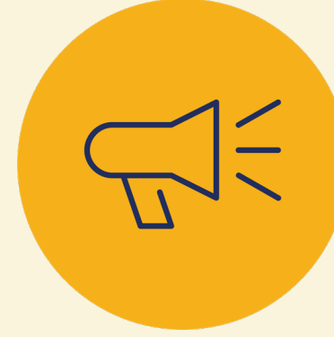
Ready-to-use promotional material for your channels