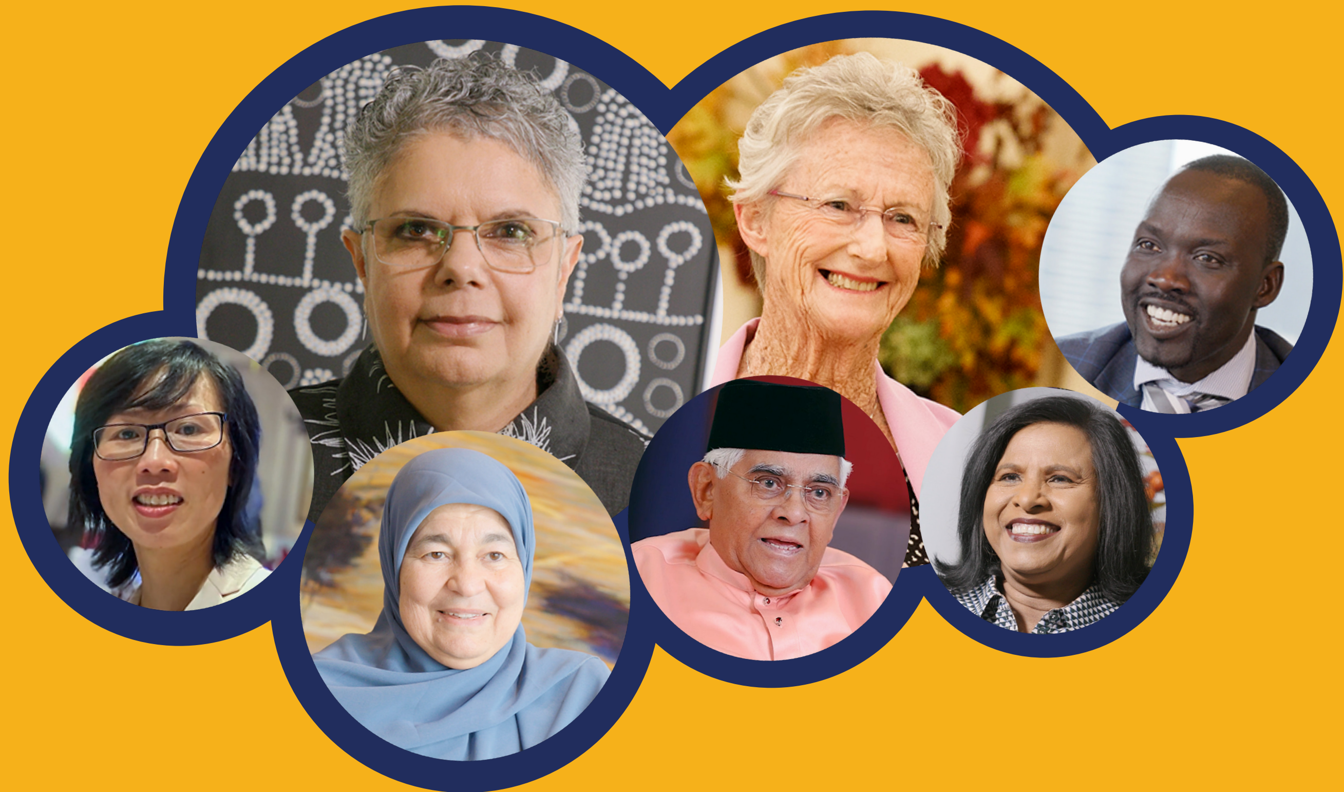
Caption: Order of Australia recipients

Alt text: photo montage of seven smiling people, who are Order of Australia recipients.