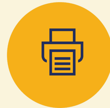
Printable A4 Fact Sheet