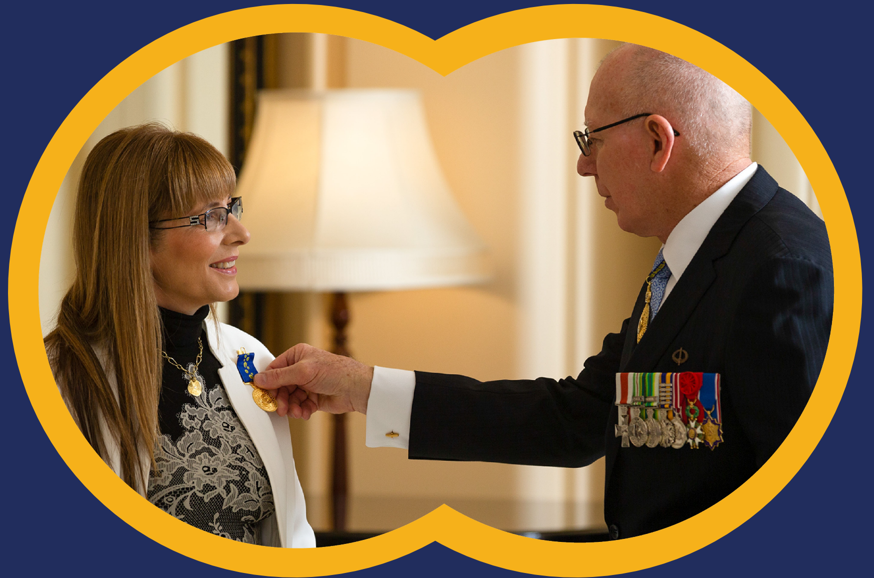
Caption: The Governor-General presenting a recipient with her medal of the Order of Australia Alt text: a woman smiling as a medal is pinned to her jacket by the Governor-General of Australia