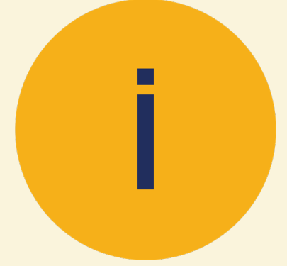
More detailed information about how the Order works

A short PowerPoint slide presentation including key information about the Order of Australia can be provided separately on request.