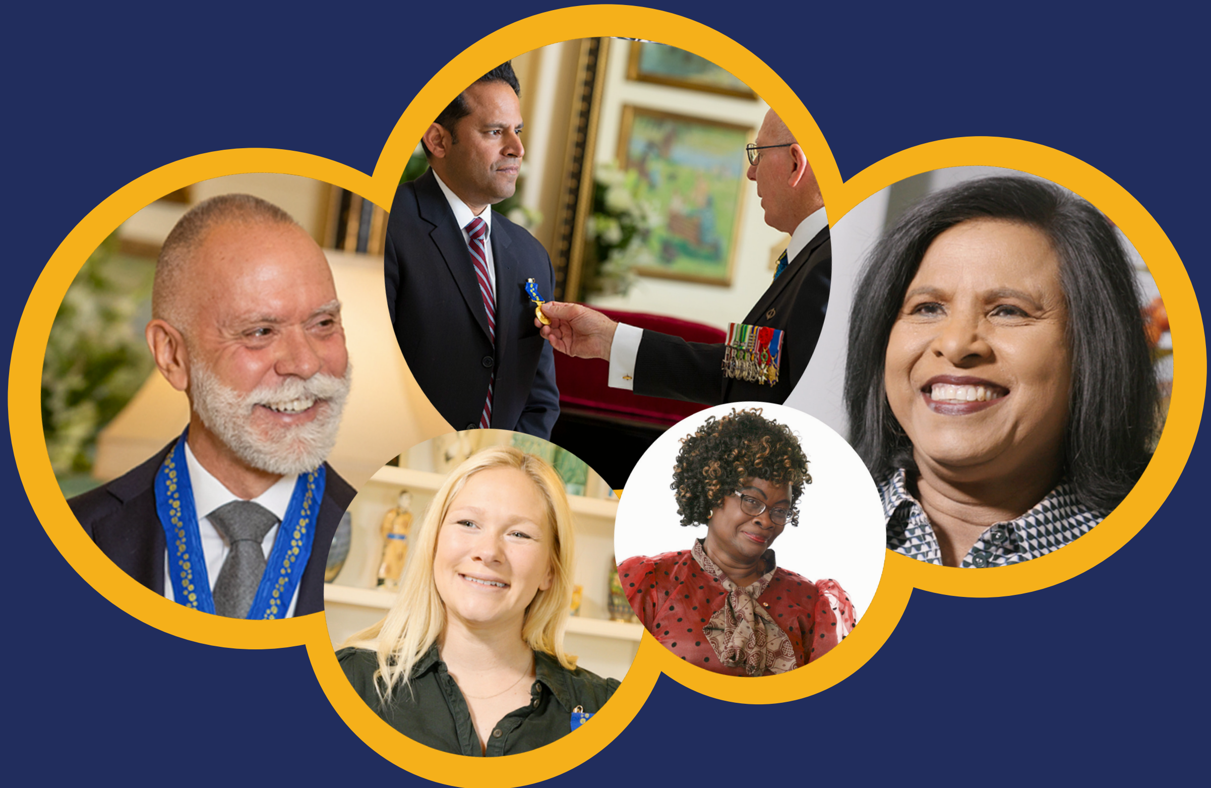
Caption: Order of Australia recipients

Alt text: photo montage of six people, including five Order of Australia recipients, and one of the Governor-General of Australia pinning a medal on a recipient's jacket