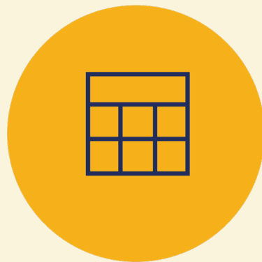
Ready-to-use social media tiles

With this suite of materials you can deliver clear and consistent messages about the Order of Australia across your communications channels.