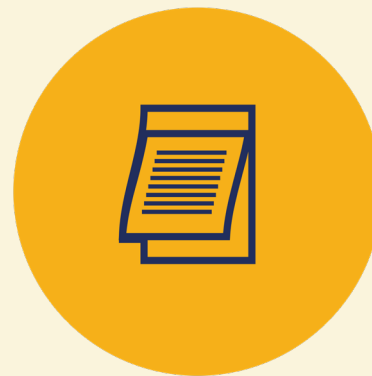
Draft social media post text