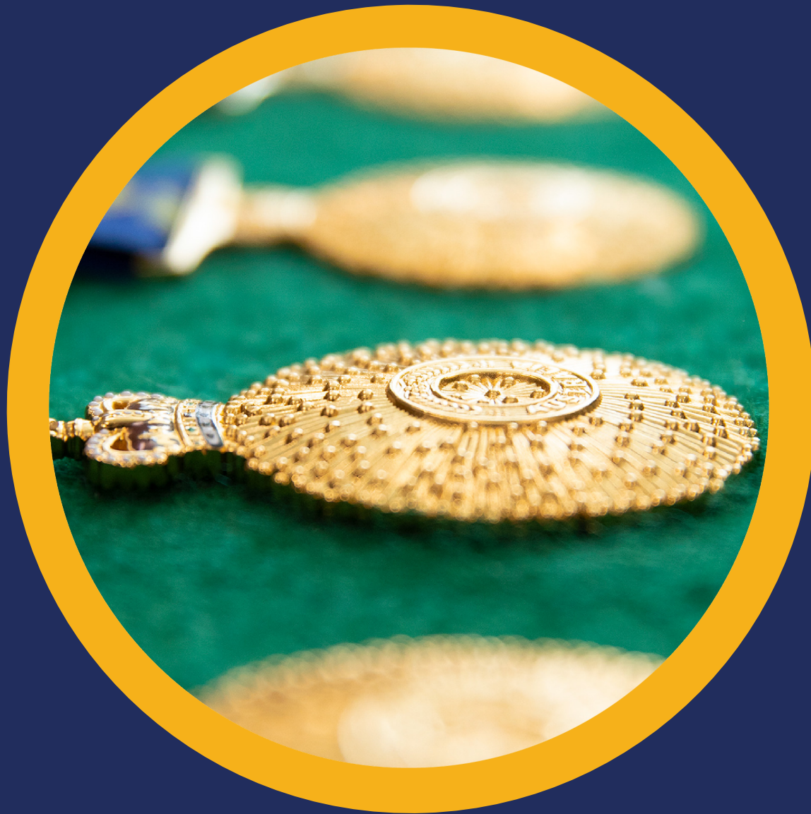
Caption: Order of Australia medal Alt text: A row of gold-coloured medals attached to blue ribbon laying on a green surface