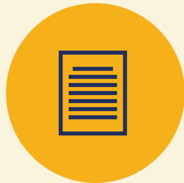
Key messages about the Order of Australia

We want you to share these messages and stories to help us inspire more Australians to nominate people who go above and beyond and have great impact in our community.